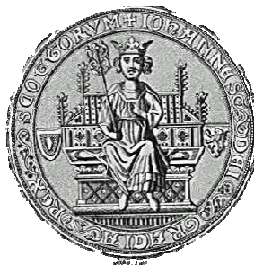
Seal of King John

Left side: Blank page for illustrations of the time period. It is most desirable that these illustrations be hand drawn although an occasional picture can be pasted in.