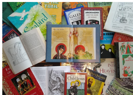
Some books scheduled in level 2

Other items you will need include basic school supplies, quality materials for art and handicrafts, hands-on science kits as required for your level, any additional supplies required by the science or geography plans, notebooks or binders for the following: copywork, written narrations, a book of centuries and nature study.