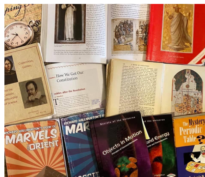
Some books scheduled in level 3

Our Facebook Group is where you can go to find out the latest: